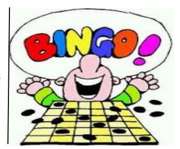
October 5th, I2th, I9th, 26th Starts Promptly at I:00 p.m.